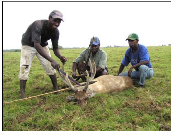
Success. The open-terrain dwelling Rusa deer is a common quarry for PNG tribal bowhunters and, yes, that's an arrow, not a spear!