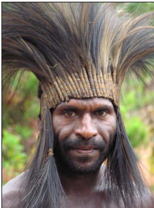
A PNG hunter in his traditional headdress.

Many consider 6%-15% arrow FOC as being the 'traditional norm', but is that true? Even 'Ultra' amounts of arrow FOC are not something new to bowhunting. This article has been included with the Study information because of the historical perspective it presents on use of Ultra EFOC arrows.