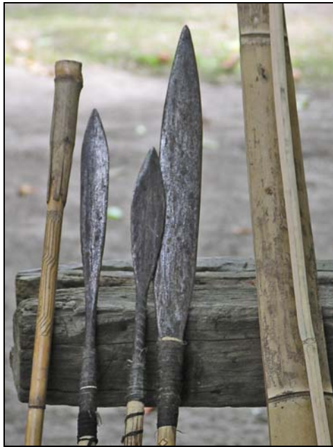
A contemporary small game blunt arrow (L) and 'broadheads'. The terminal end of the blunt is concave.