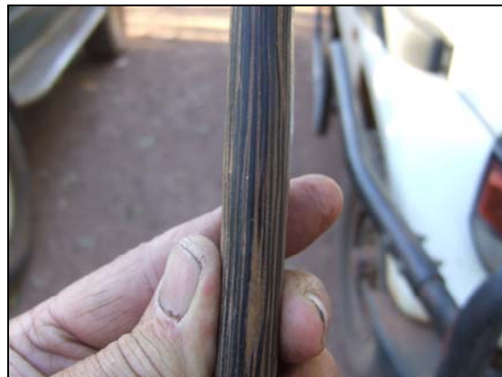
Belly (L) and side view (R) of upper limb of the shorter black palm bow. The finish of each bow shows careful workmanship.