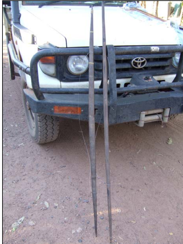
The pre-WWII era black palm bows.

The older bows are carefully crafted and carried flat, braided strings of plant fiber, though most of their string is now missing. One of the early-era bows is a bit over sixty-three inches long, the other a shade over sixty-seven inches. Because of the age and rarity of the bows stringing them was not feasible. Feeling the floor-tiller and comparing it to my own 82# longbow I estimated the draw weight of each to be approximately 80 pounds.