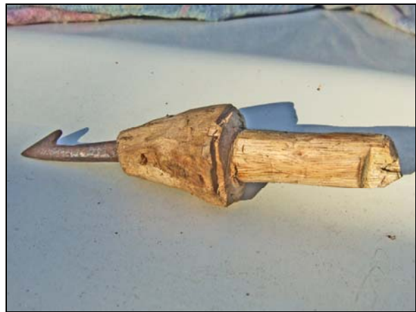
Crocodile arrows (L) and close-up of the detachable point (R). The barb on this point is scarcely 1" long, and some are shorter; just long enough to anchor into the crocodile's tough skin. A cord is attached to the point and shaft to tether them together, and the cord coiled around the arrow's fore-shaft. After a hit the tethered cane shaft acts as a float-marker, which is followed until the crocodile can be carefully and slowly brought to the surface with the cord, where it is dispatched with hunting arrows.