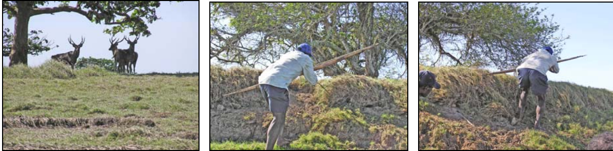
Three Rusa stags being stalked. Note second stalking hunter in the left edge of the third photo. Though they often 'team stalk' only one hunter shoots at a time.

Both stalking and stand hunting are common methods used for the larger animals. Considering the appearance of the equipment used it was surprising to discover that these tribal hunters routinely take game at 25 yards or more with their lengthy, unfletched arrows; especially the Rusa deer. The open-country dwelling Rusa are primarily hunted by stalking.