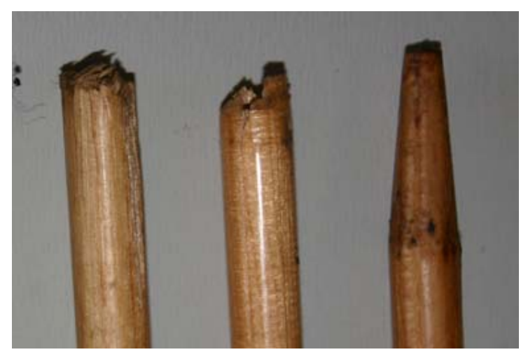
The most common point of wood shaft failure is also at the taper.